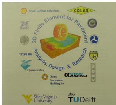
Figure 2. Symposium

In 1996, WVU received funding from MAUTC to initiate a research program in the area of 3-D Finite Element Modeling (FEM) of pavements. At the time, 3-D modeling was considered a new area of research given the complexity associated with going from 2-D models to 3-D dynamic models. The research at WVU was a great success leading to accurate models that incorporated many of the complications of highway pavements and their loading conditions.